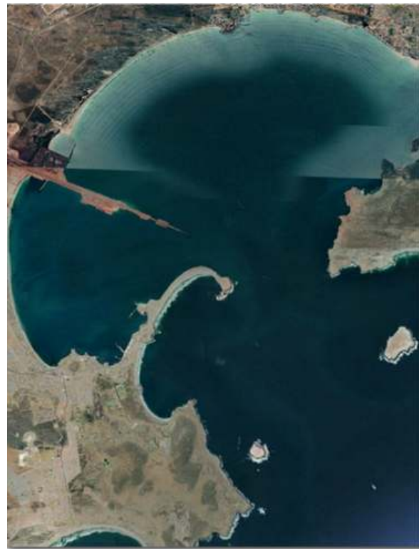
Figure 2: Saldanha bay 2024

Figure 1 shows Saldanha bay before the construction of the port and Figure 2 shows Saldanha bay in 2024. Initially the Port's primary aim was to export iron-ore.